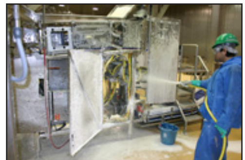
All components, both internal and external, have been chosen to withstand daily wash down