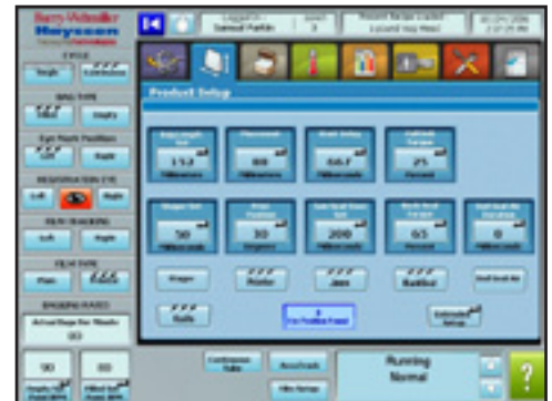
Advanced user interface simplifies programming

We have extensive experience in integrating a wide variety of feed systems including scales, augers, volumetrics and pumps for a wide variety of applications.