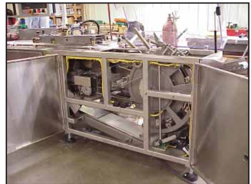
Open Access Front and Rear Frame