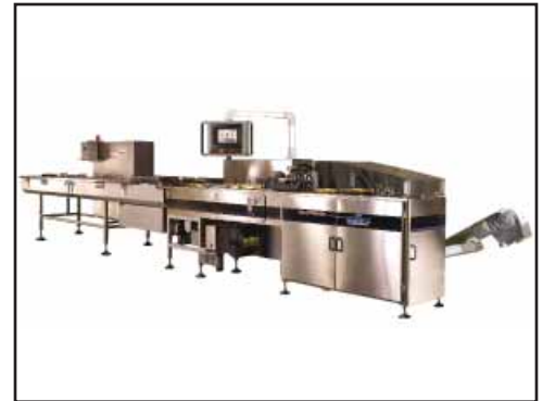
HayssenSandiacre offers infeeds to the RT for a fully integrated packaging solution

Let us customize the RT2000 to meet your specific requirements. Whether it is a specific package style or a production need, the RT2000 is a proven high speed performer. We also offer high speed infeeds for an integrated packaging solution. The RT2000 offers easy interface to many 3rd party feed systems.